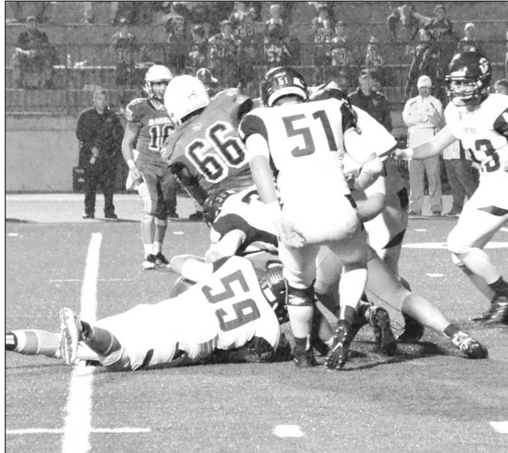
The Union County defense swarms a Dawson County running back during the first half of last Friday's game. Following the North Hall game, Union gets its much-needed bye week. The Panthers defense could be playing shorthanded due to injuries this week as they try and circle the wagons vs North Hall and avoid falling to 1-3 in Region 7-AAA play.

Wright kept the drive alive with a third down completion for 12 yards before moving the chains again with a short gain on 3rd-and-2. Later, Hemphill went up high to reel in a pass from Wright for eight on 3rd-and-6, then Wright kept it himself for a pick up of 37 to move Union inside the five and set up Lynch's first score